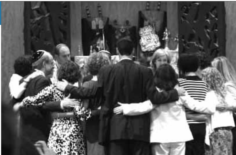
Adult B'nai Mitzvah Class

When Abraham was commanded in the Torah, " Lech V'cha! Go Forth," he was commanded to go to himself, to his roots because as Rabbi Aharon of Karlin said, that is a Jew's purpose. This year take your journey, find meaning, because " We have a class for that! " □