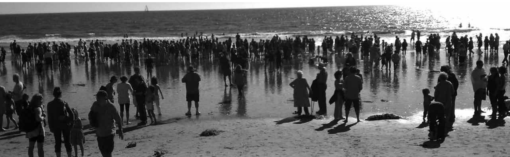
Over 500 Isaians gathered at Tashlich Services

Why an ark in our library? So that we have a smaller chapel space for more intimate services, for healing, for teens, for meditation, for special speakers and presentations, for lifelong learning and drawing near to Torah...for the study of Torah encompasses them all. Come in. □