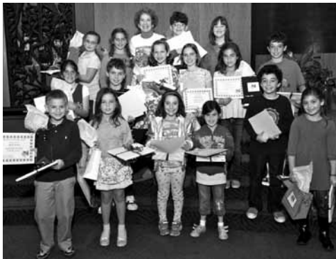
Levine Library Reading Contest Winners

Shanah tovah! I hope that in our pages this month you will discover the many doorways that are open to you at Temple Isaiah: Opportunities for gathering, learning and participating in so many ways. Come in! The High Holy Days may have passed, but we are still singing!